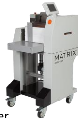
Omni-Flow Optional Deep Pile Feeder