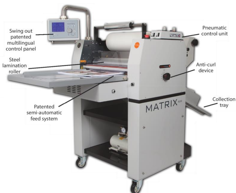
MX-530P Single Sided Laminating System