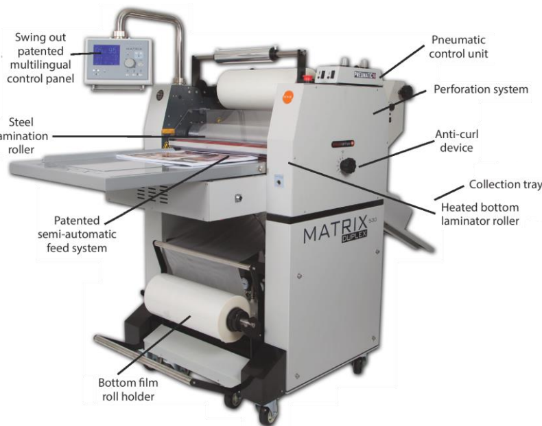
MX-530P Double Sided Laminating System