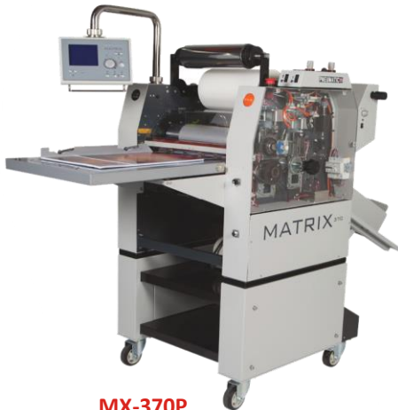
MX-370P Pneumatic Single-sided laminator