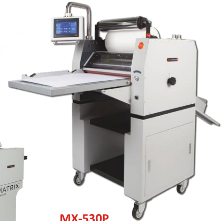
MX-530P Pneumatic Single-sided laminator