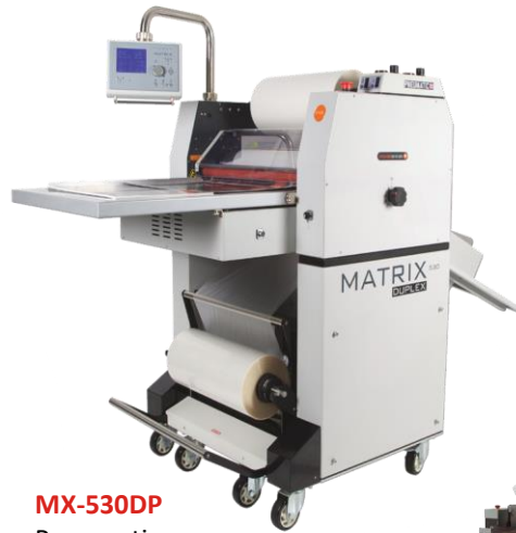
MX-530DP Pneumatic Double-sided laminator