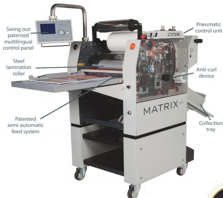
MX-370P Single Sided Laminating System