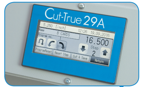
Touchscreen Control Panel allows for programming up to 100 jobs