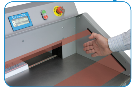
Infrared Safety Curtain shuts down operation if the beam is interrupted