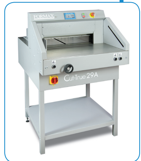
Standard model, without optional wide side tables

Formax – New Hampshire, USA www.formax.com