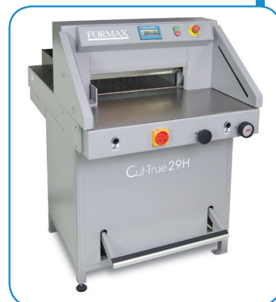
Standard model, without side tables