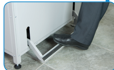
Foot pedal pre-clamp holds paper to check alignment prior to cutting