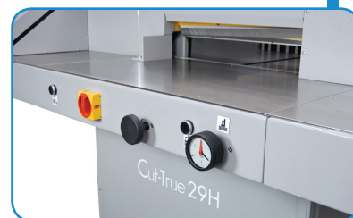
Two-button operation, fine-tune knob, adjustable hydraulic pressure gauge