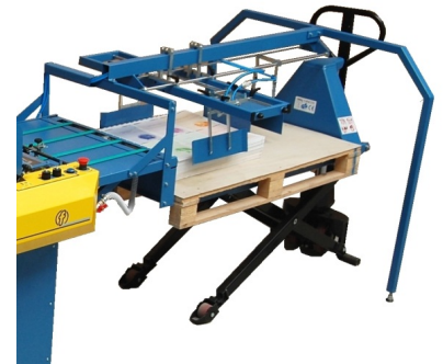
Optional Pallet Stacker