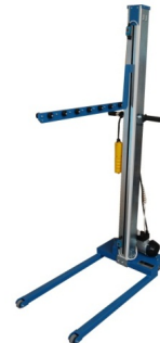
Optional Film loader