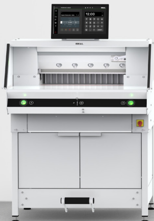
Shown with optional base frame panels.