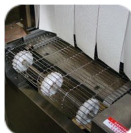
Stainless Steel Metal Mesh Belting