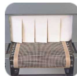
Teflon Mesh Belting