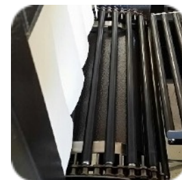
High Density Rollers - Close Roller Spacing 1/2" Gap

The PP1808-28 Shrink Tunnel is a great general purpose shrink tunnel that can be used for a wide variety of applications. Can be used with shrink bands, neck bands, full body sleeves, used with shrink film, used as a drying or curing tunnel etc.