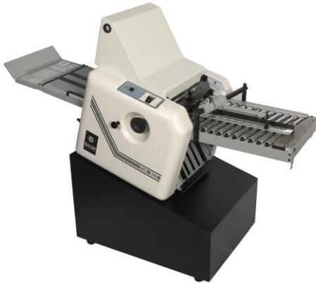
714 XLT Right Angle Folder

The Baum 714XLT 8-page Right Angle folder is the ideal companion to the 714XLT air feed tabletop folder.