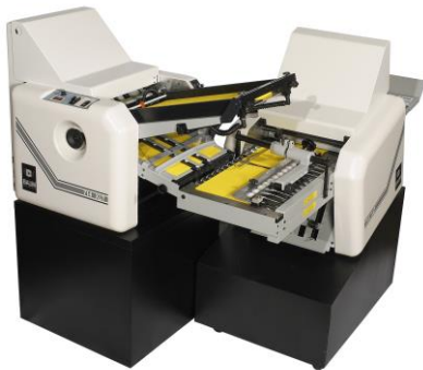
714XLT Air Feed Folder w/ 714XLT 8-page

The Baum 714XLT 8-page Right Angle folder is the ideal companion to the 714XLT air feed tabletop folder.