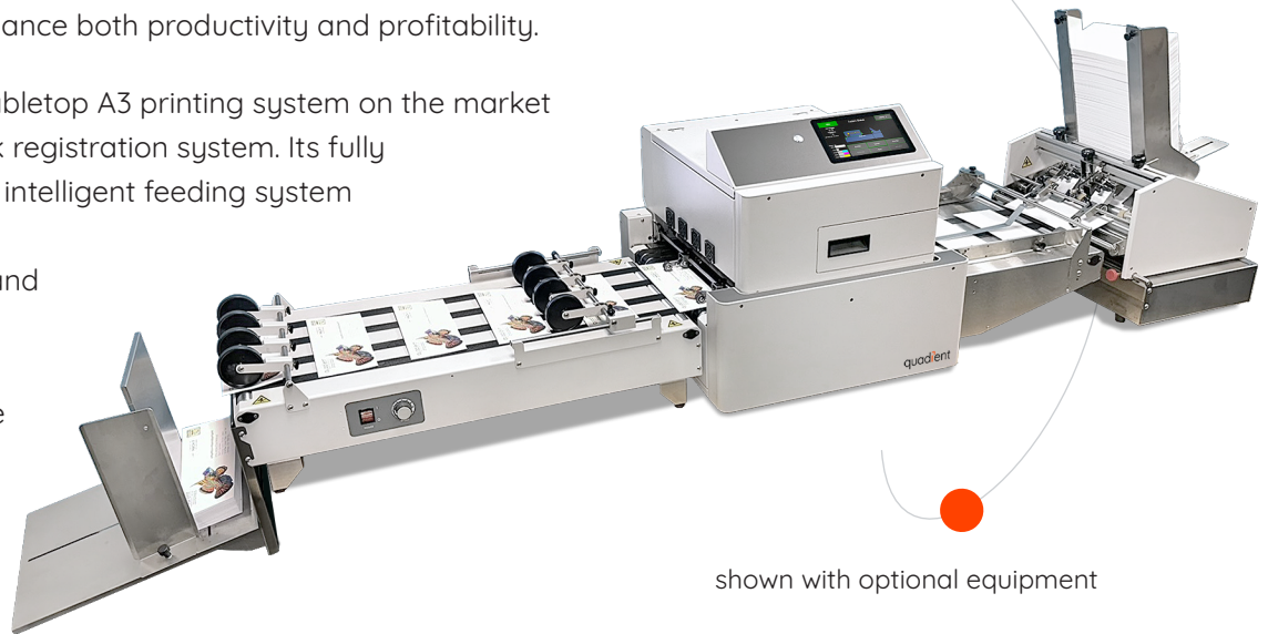
shown with optional equipment

The MACH 7 is the first tabletop A3 printing system on the market with our built-in AccuTrak registration system. Its fully synchronized and robust intelligent feeding system optimizes throughput, offering precise control and simplifying setup. Faster throughput and more affordable inks save time and money and increase profit on every job.